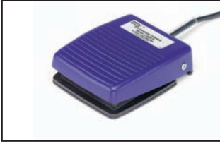
ECM™ 830 Footswitch

CAUTION FOR RESEARCH USE ONLY NOT FOR CLINICAL USE ON PATIENTS