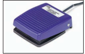
ECM™ 830 Footswitch

Internet: www.btxonline.com (click on customer service)