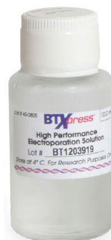
BTXpress High Performance Electroporation Solution